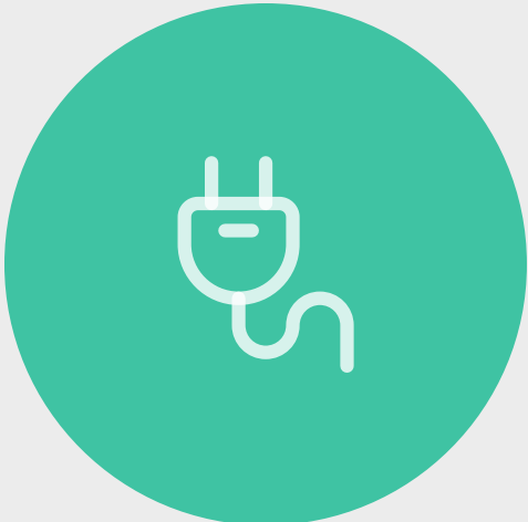
Setting up for success