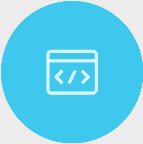
Employee Experience Platform Est. 2006