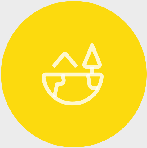
Global UK, USA, CA, AUS, HK