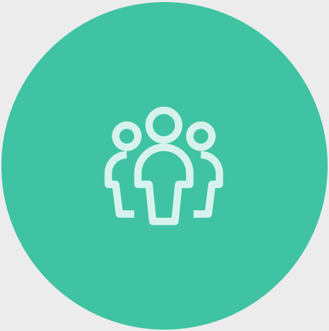
Enterprise Users 3.5 million+