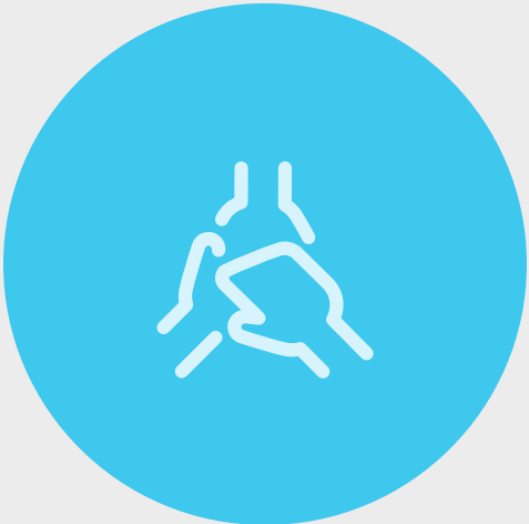
Culture and engagement